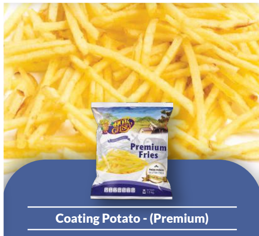
Coating Potato - (Premium)