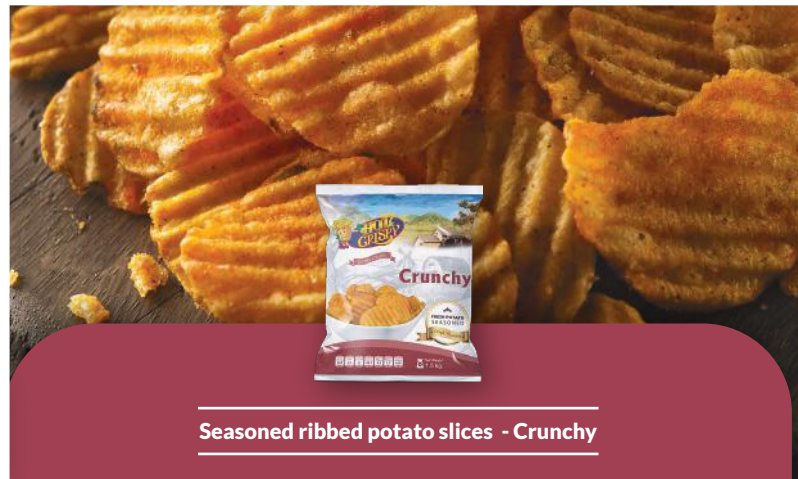
Seasoned ribbed potato slices - Crunchy