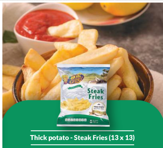
Thick potato - Steak Fries (13 x 13)