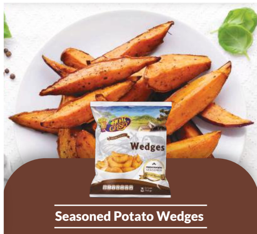
Seasoned Potato Wedges