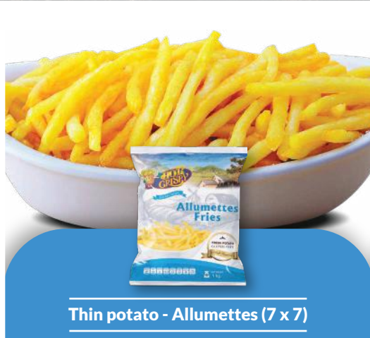
Thin potato - Allumettes (7 x 7)