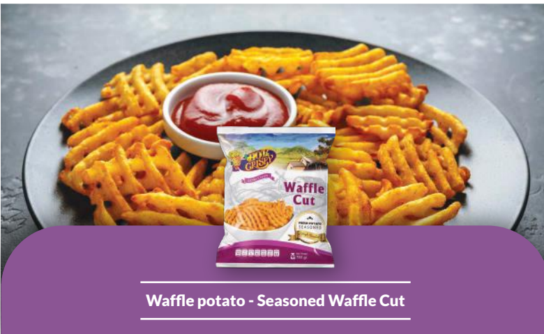
Waffle potato - Seasoned Waffle Cut