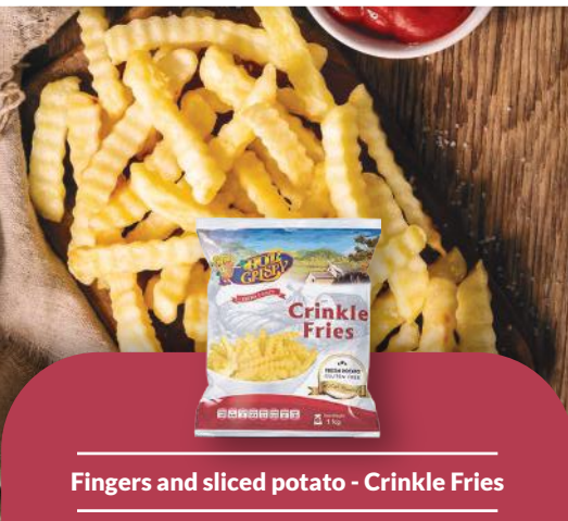
Fingers and sliced potato - Crinkle Fries